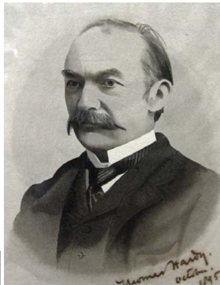
Afbeelding van Thomas Hardy